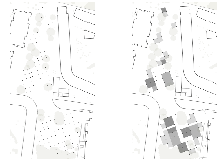
[3] system of rules: grid - zoning plan