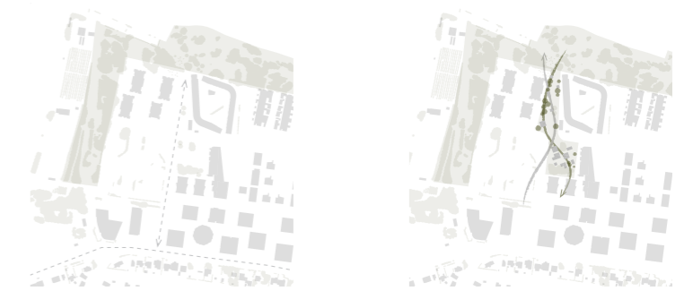
[1] connection of wilderness and residential area